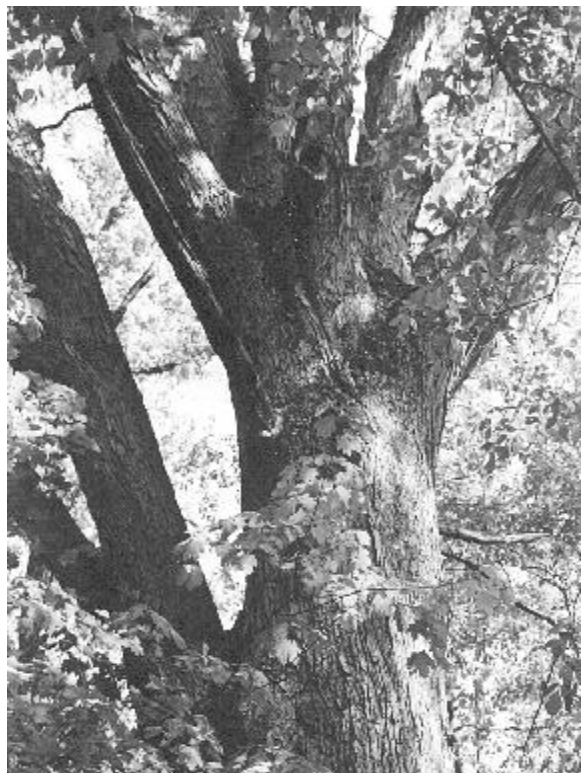
The Palisades can stake a claim to having the largest white oak in the District. The majestic tree, which lords over the triangle of woods between Dalecarlia and Loughboro, is 15 feet, five inches in circumference and is estimated by an experienced arborist to be at least 300 years old.

Attendees developed a list of 12 key issues for Cluster 13 neighborhoods: public schools; public infrastructure; public transportation; parking; public safety; government accountability; DC facilities [parks, etc.]; quality of life