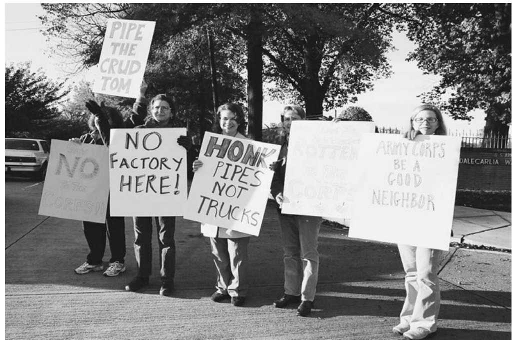
Concerned Neighbors including the Palisades Citizens Association/ANC 3D demonstrate against the Army Corps of Engineers plans to build an industrial facility behind Sibley Hospital and bring 20-ton truck traffic into residential neighborhoods including Palisades. The demonstration took place on Wednesday, October 26 during morning rush hour in front of the Washington Aqueduct Facility at 5900 MacArthur Boulevard.