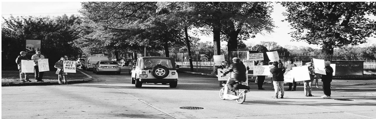
Neighbors from Brookmont, Western Avenue and Westmoreland in Maryland join neighbors from the Palisades, Spring Valley, and Foxhall to protest the Army Corps of Engineers' decision to build an industrial dewatering facility behind Sibley Hospital and truck residuals out through our neighborhoods.