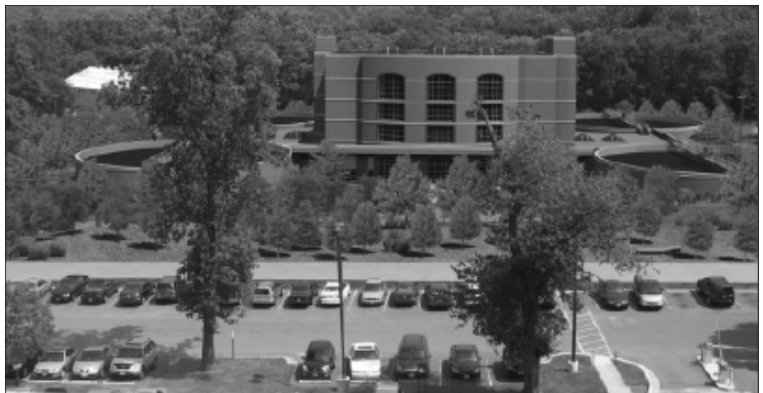
Photo simulation of Residuals Processing Facility from the seventh floor of Sibley Memorial Hospital.