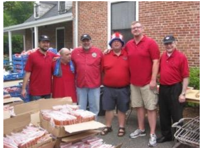
Free Mason Grillers

A tip of the hat always goes to Members of the Free and Accepted Masons of the District of Columbia and volunteers from the Georgetown-Palisades Lions Club for their assistance.