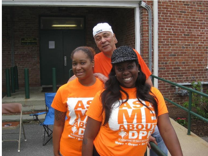
Awesome DPR Staff

The community could not do a parade like this every year without some serious support from the city. We're especially grateful to the Department of Parks and Recreation for providing such a lovely site as the Rec Center and their wonderful staff. The PCA is also grateful to the support we regularly receive from both the Metropolitan Police Department and the Fire Department.